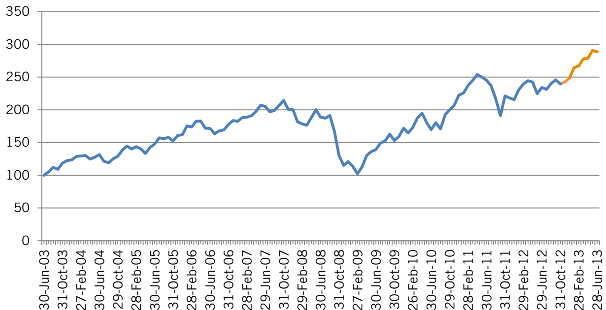
CRSP US SMALL CAP GROWTH INDEX

Based on backtest data through September 7, 2012